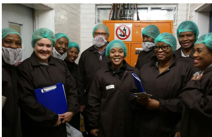
A member the Risk Communication Team explaining the 'WHO 5 keys to safer food' at a risk communication workshop in Limpopo province, Friday 1 June 2018