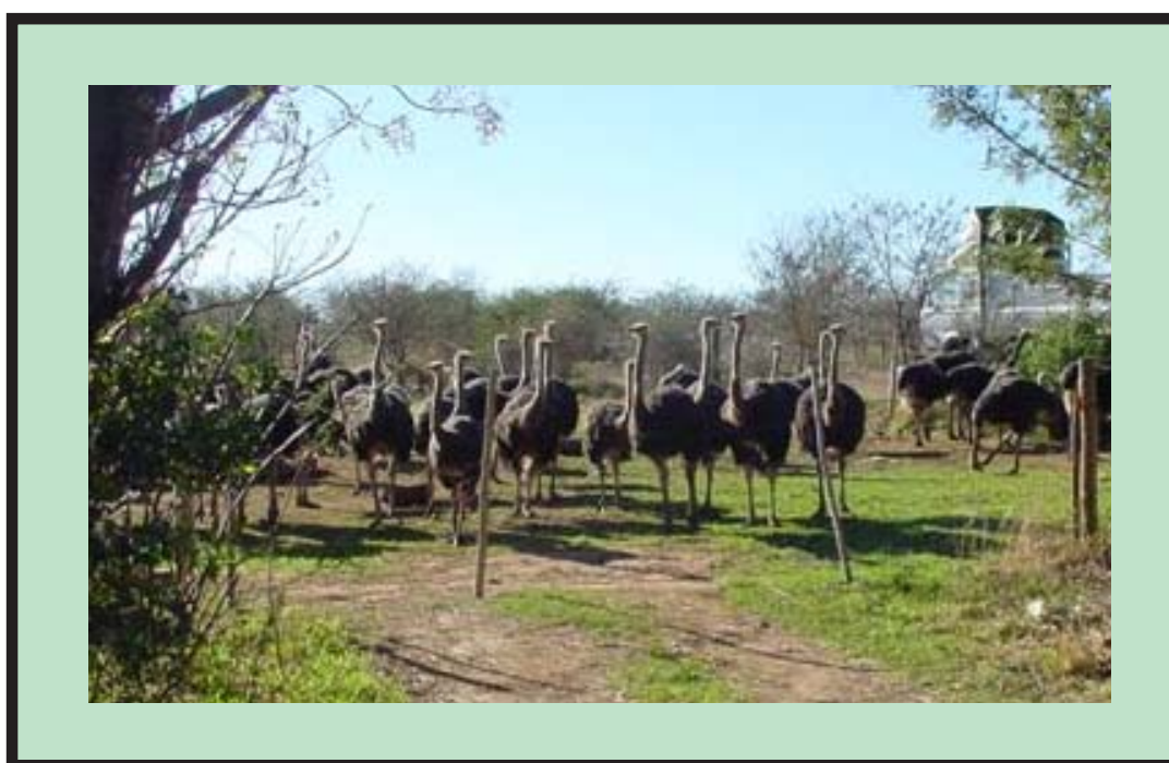
Eastern Cape ostriches during an outbreak of avian influenza H5N2 in August 2004.

A bimonthly publication of the National Institute for Communicable Diseases (NICD) of the National Health Laboratory Service (NHLS)