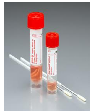
Figure 2 : Flocked swab and Universal Transport Medium