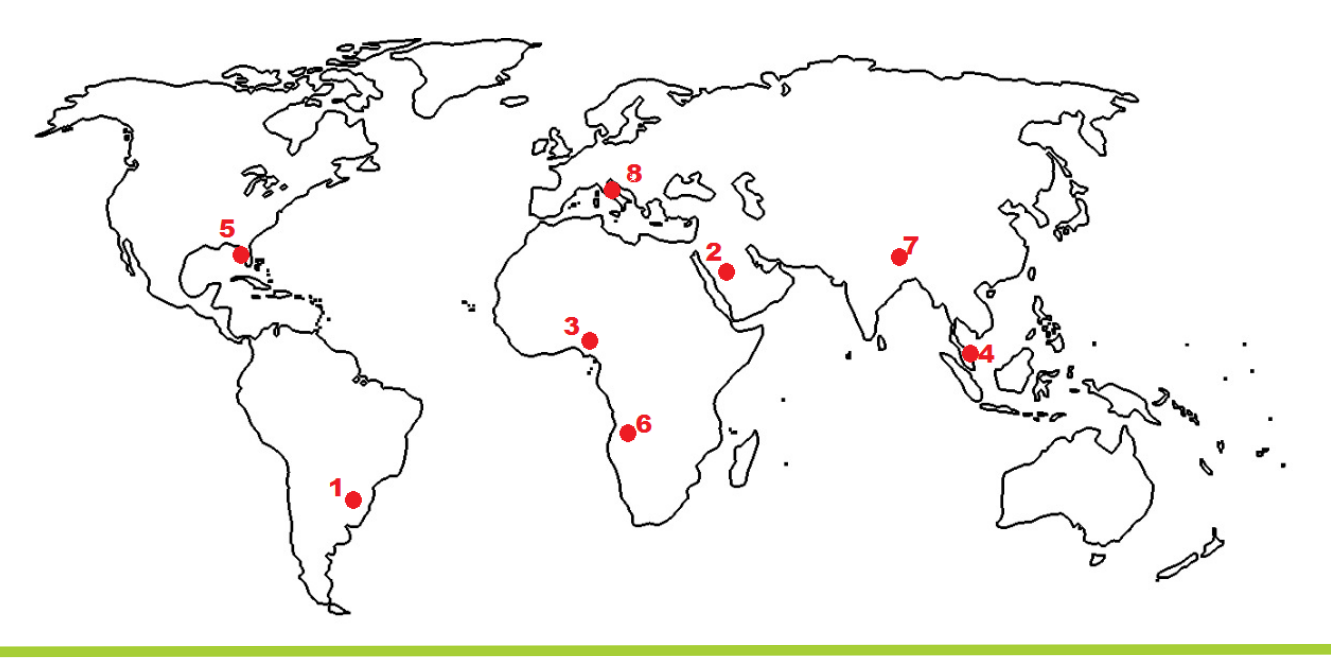
Figure 3. Current outbreaks that may have implications for travellers. Number correspond to text above. The red dot is the approximate location of the outbreak or event