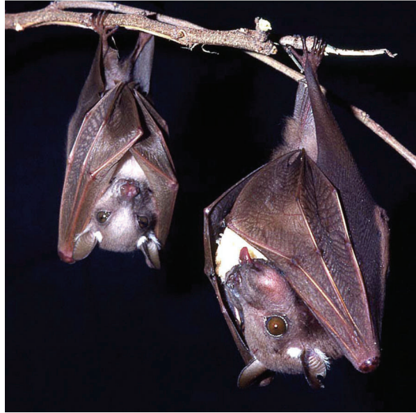
Figure 1. Wahlberg's epauletted fruit bats.