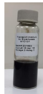
Figure 2B. Regan-Lowe semi-solid transport medium