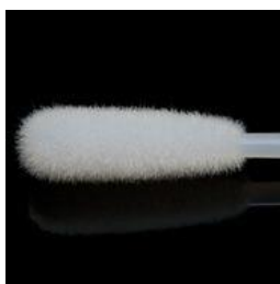
Figure 2A. Flocked swab

For PCR only: swabs should be placed in universal transport medium (UTM) immediately and transported at 2-8°C within 48 hours, to the microbiology laboratory.