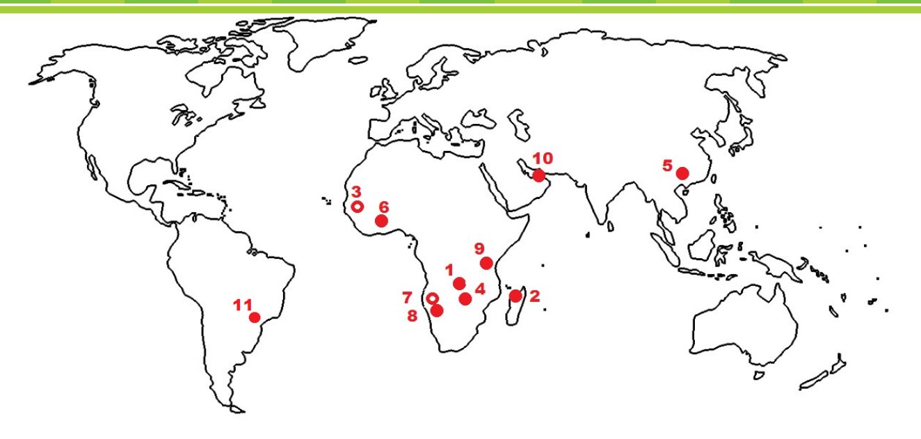
Figure 5. Current outbreaks that may have implications for travellers. Number correspond to text on the previous page. The red dot (solid=cases; open=zero report/no cases) is the approximate location of the outbreak or event