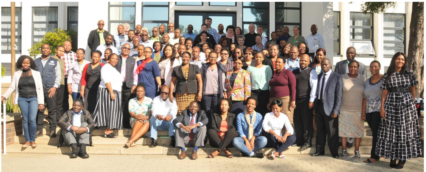
Attendees at the National Listeriosis workshop, held at the NICD 23-24 April 2018

Activities conducted by the IMT over the past three days include factory visits, ongoing surveillance and investigation of cases, motivations to obtain additional funding and preparations for the week commencing 7 May which includes factory visits and discussion of findings, training activities for EHPs and planning the provincial training schedule.