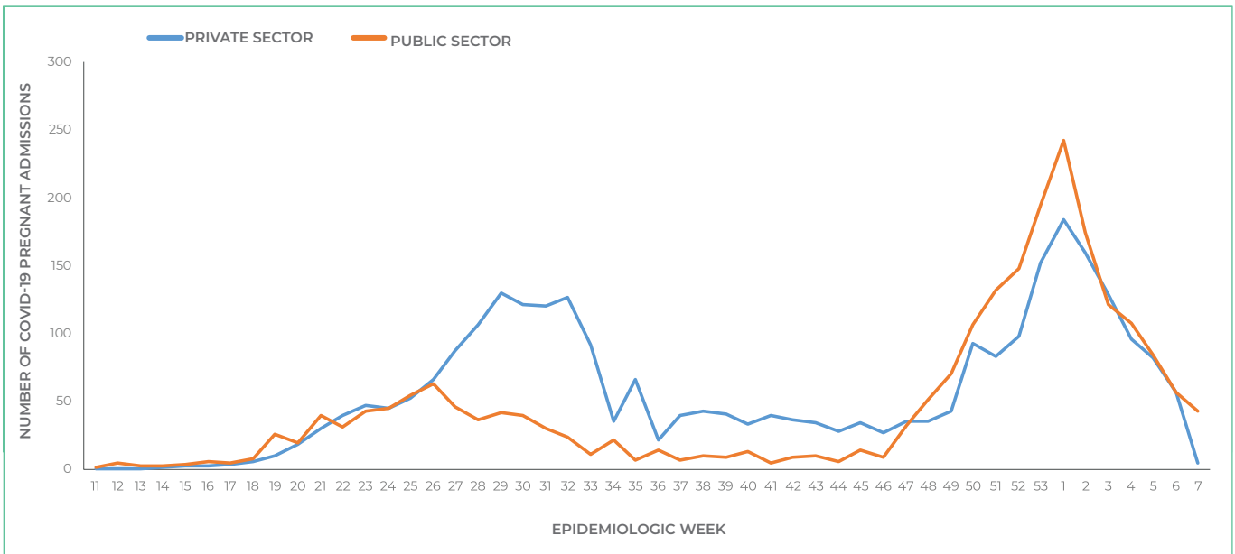
Figure 2. Number of reported COVID-19 admissions in pregnant women of childbearing age, by health sector and epidemiologic week, South Africa, 5 March 2020 - 20 February 2021, n=5,105.

During the first wave, most admissions in pregnant women of childbearing age were in Western Cape and Gauteng provinces. The peak of the second wave exceeded the first wave with most admissions in Western Cape, KwaZulu-Natal, Eastern Cape and Gauteng provinces (Figure 3).