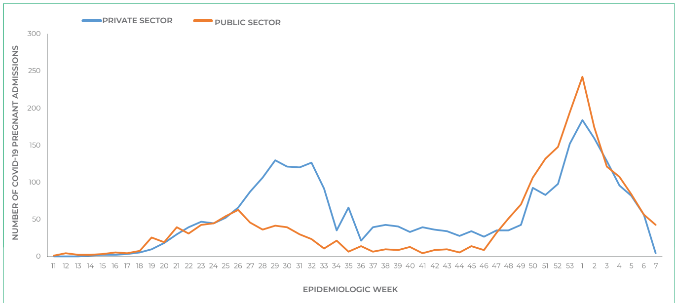
Figure 2. Number of reported COVID-19 admissions in pregnant women of childbearing age, by health sector and epidemiologic week, South Africa, 5 March 2020 - 20 February 2021, n=5,105.

During the first wave, most admissions in pregnant women of childbearing age were in Western Cape and Gauteng provinces. The peak of the second wave exceeded the first wave with most admissions in Western Cape, KwaZulu-Natal, Eastern Cape and Gauteng provinces (Figure 3).