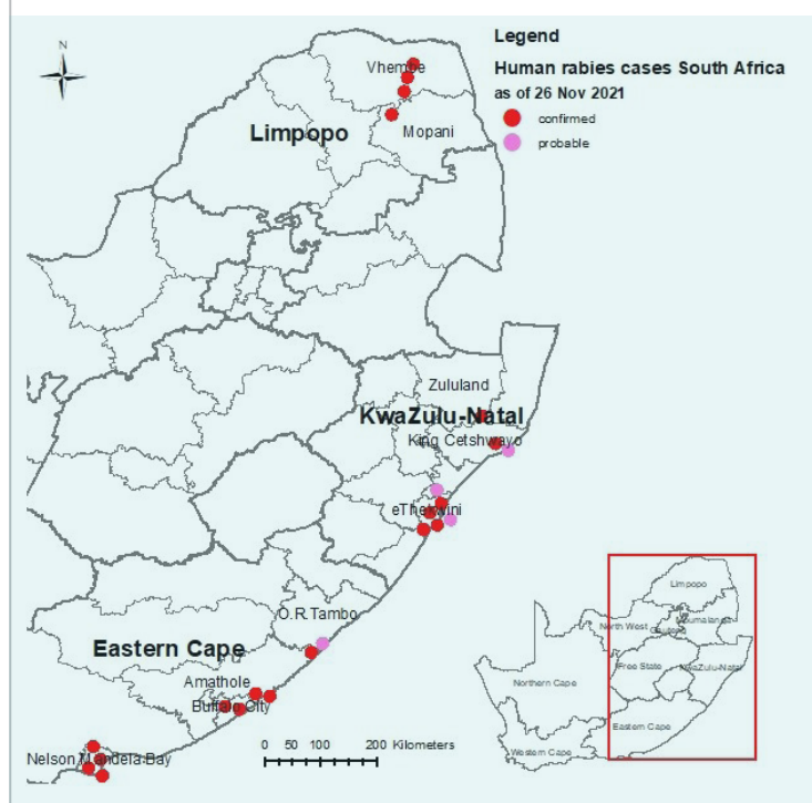
Figure 1. Human rabies cases in South Africa for 2021 as of 14 December (created from NICD data)

The NICD website, www.nicd.ac.za/rabies, has more information on rabies and rabies PEP.