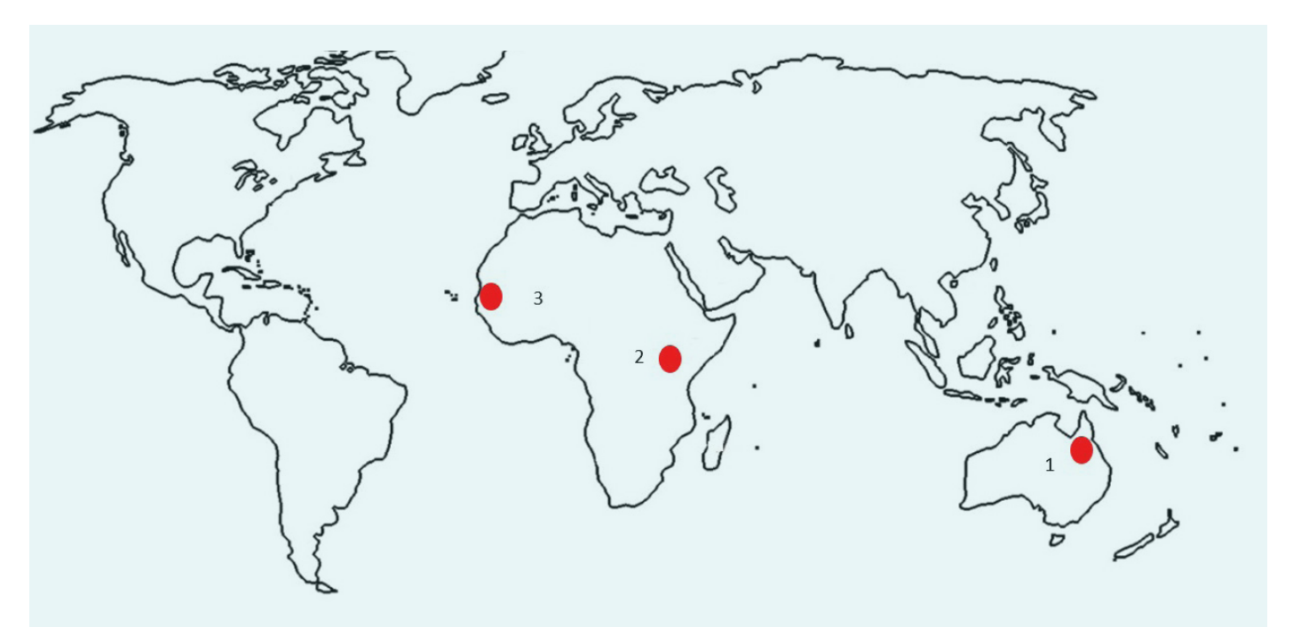
Figure 3. Current outbreaks/events that may have implications for travellers. Numbers correspond to text above. The red dot is the approximate location of the outbreak or event.

There is a vaccine available for animals but not for humans. The only measures available to prevent RVF virus infection are to avoid mosquito bites or contact with infected animals and their products. Treatment for more serious disease manifestations may require hospitalisation and supportive care.