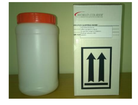
Figure 2: Commercially available category A packaging that will be available to NHLS Laboratories