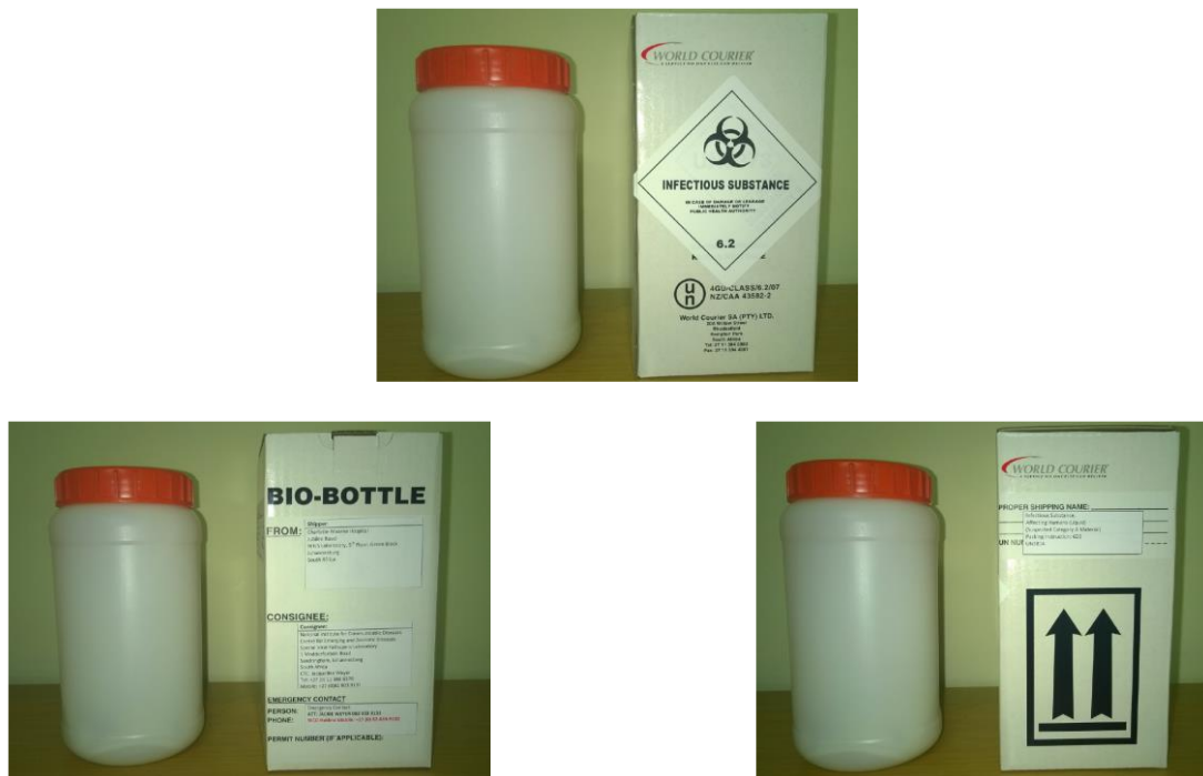
Figure 2: Commercially available category A packaging that will be available to NHLS Laboratories