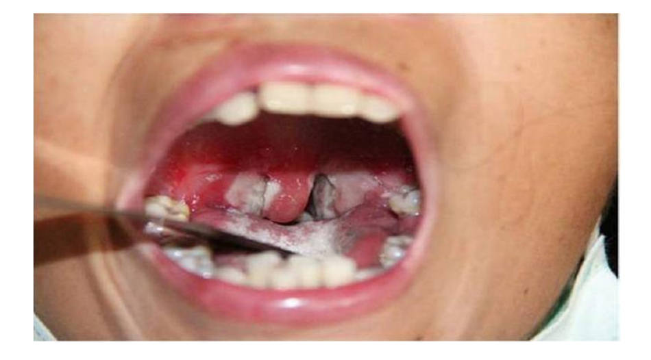
Figure 2: Example of the adherent membrane of diphtheria