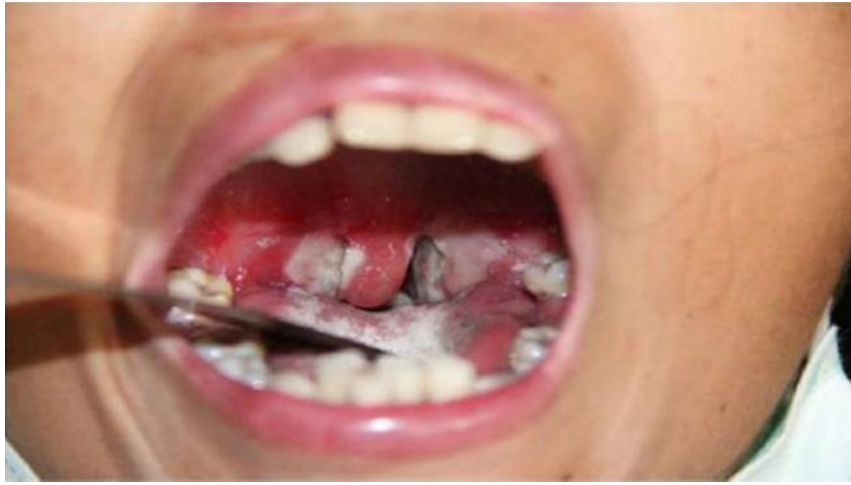
Figure 2: Example of the adherent membrane of diphtheria