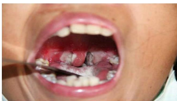
Figure 2: Example of the adherent membrane of diphtheria