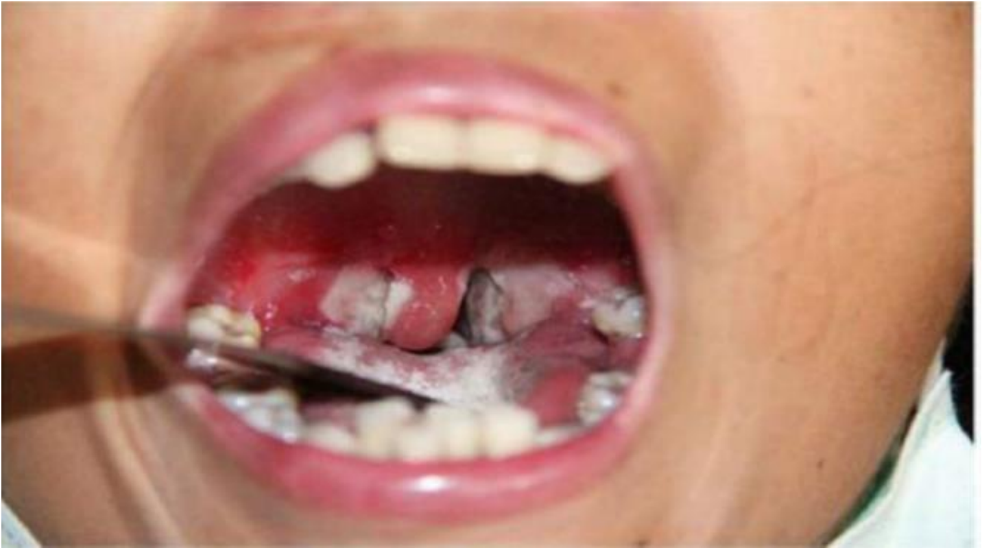
Figure 3: Example of the adherent membrane of diphtheria